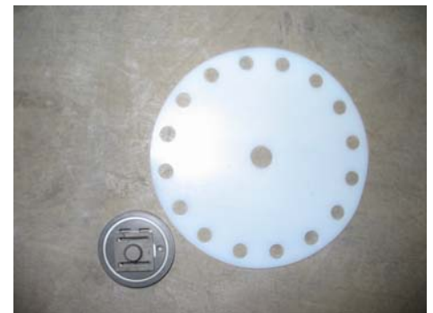
Jorlon diaphragm, and sliding gate seat set