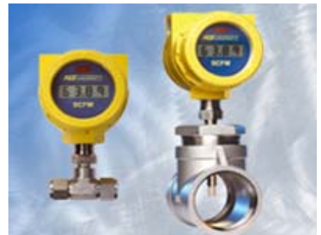
ST75 in-line flow meter

By combining precision lithography structured platinum RTD sensors embedded in FCI's equal mass thermowells with microprocessor elec-