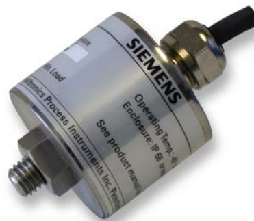
AS100 acoustic sensor

Operating with a SITRANS CU 02 control unit, the system can detect conditions of high flow, low flow, or no flow. The CU 02 has two relays which are fully programmable and independent of each other which can be used to operate an alarm or control device. It also has a 4-20mA output that