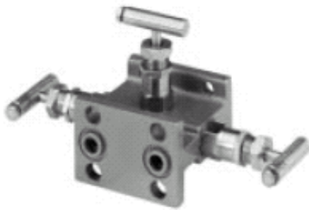
Three valve manifold for differential pressure transmitters

If a very viscous material is being measured, or where a tank and its sensing lines are exposed to freezing temperatures, the DP may also be equipped with remote seals. The application must be looked at closely, especially where the process is hot and the transmitter is in a cooler or possibly cold area. Temperature affects fill fluid. Application review is suggested in these installations especially where a narrow range of measurement is in-