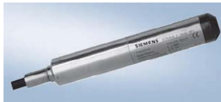
Submersible pressure transmitter with sealed cable

two conductors for the 4-20mA loop powered output, but also containing a breather tube. This allows the back side of the diaphragm to read atmospheric pressure. Compact in design, they are used frequently in water wells, or with a more open front end around the sensing diaphragm and with an Intrinsically safe design, installed with safety barriers to measure sewage lift station or wetwell levels. They are ideal for industrial application like in ground con-