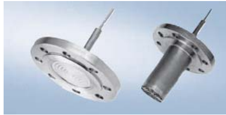
Remote seals can have flush diaphragms, or extended diaphragms

Submersible transmitters are GAGE transmitters with a water tight cable attached containing not only the