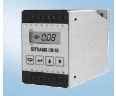
CU-02 acoustic controller