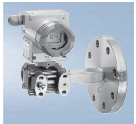
Flanged pressure transmitter for level

The same rule of mounting above potential accumulating sludge holds true, and the transmitter will only read from the elevation at which it is mounted. If the differential transmitter with it larger diaphragms is being used due to a narrow range measurement span, and the low side is just vented to atmosphere with no gaseous pressure above the liquid level, the same simple block and bleed can be installed as in the case of the gage transmitter. If there is a positive pressure above the liquid, requiring connection to the low pressure side, a three-valve manifold can be used. Fitting on the face of the trans-