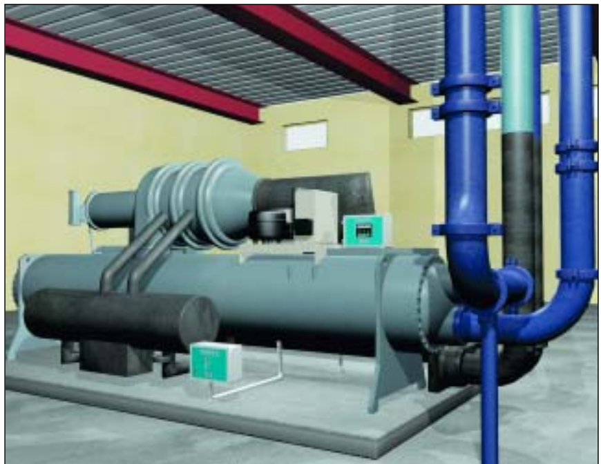
Figure 1: A single chiller located in the mechanical room. The Chillgard LS Monitor(s) is located near the floor for detection of the refrigerant gas. The LC Module is located at eye level providing gas concentration and alarm indication. (Chillgard LS Monitor can exist as a stand-alone monitor.)