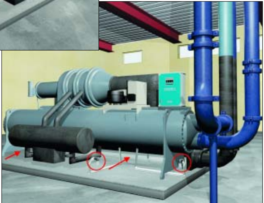
Figure 4: A Chillgard LE Monitor is located in the mechanical room providing integrated sensing and controlling. Up to four points of monitoring provide for maximum protection around the chiller.