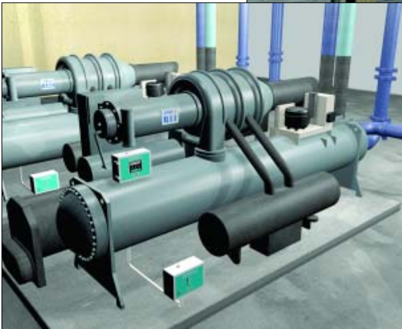
Figure 2: Two chillers containing different refrigerants requiring only one sample point each. The refrigerant-specific Chillgard LS Monitors are located near the chiller with the refrigerant of interest. The LC Control Module provides monitor-specific information for both Chillgard LS Monitors.