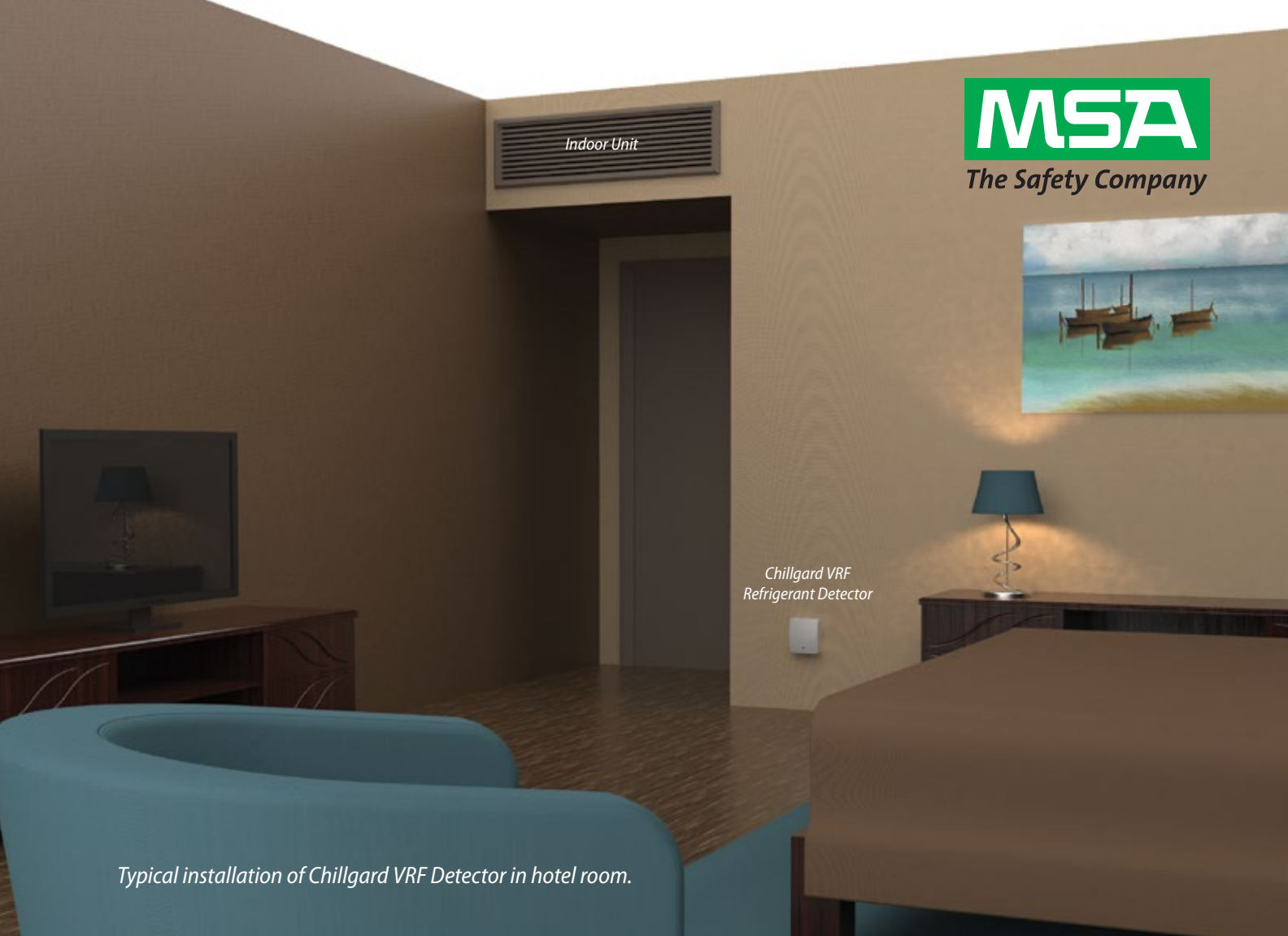
Typical installation of Chillgard VRF Detector in hotel room.